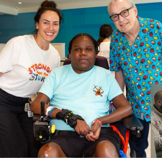
Holtz Children's Hospital 2025