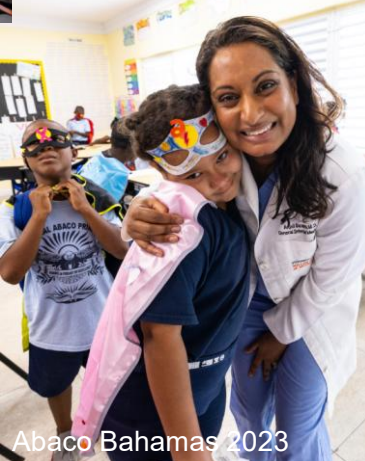
Abaco Bahamas 2023