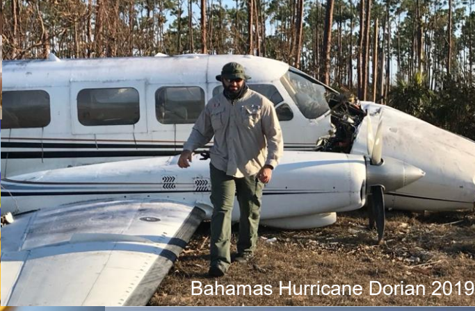
Bahamas Hurricane Dorian 2019