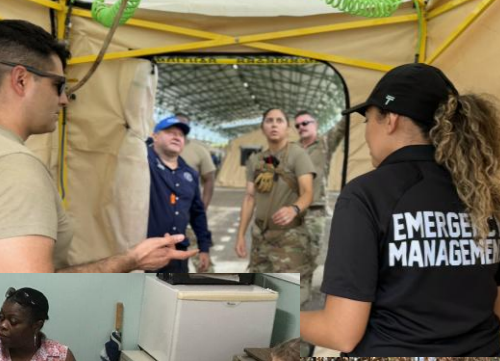
Costa Rica 2024