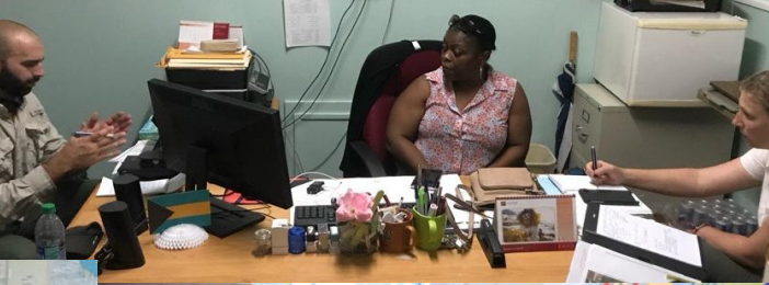
Abaco Bahamas 2023