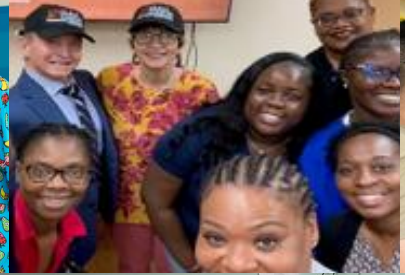
Abaco Bahamas 2024